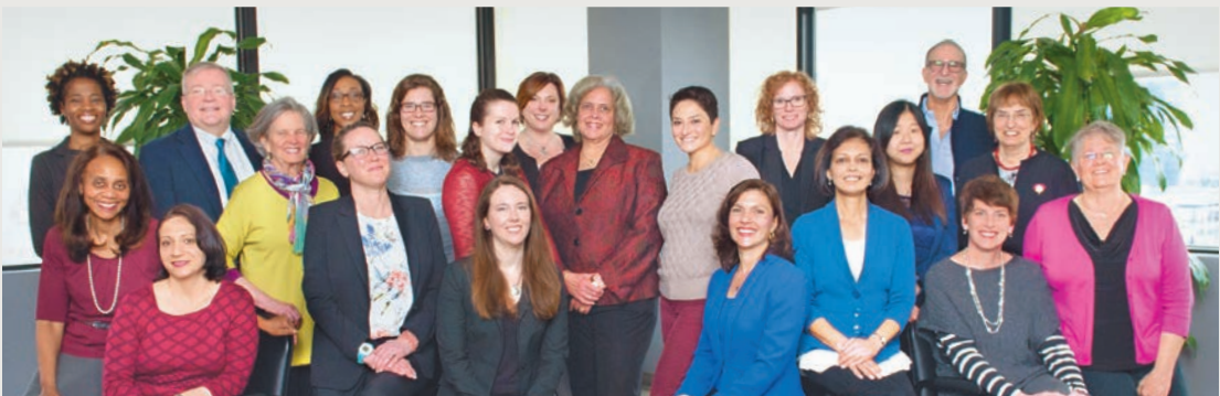
COMMUNITY INVESTMENTS ▶