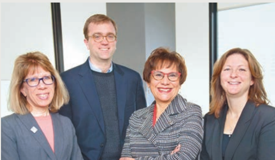
OFFICE OF THE PRESIDENT ▶