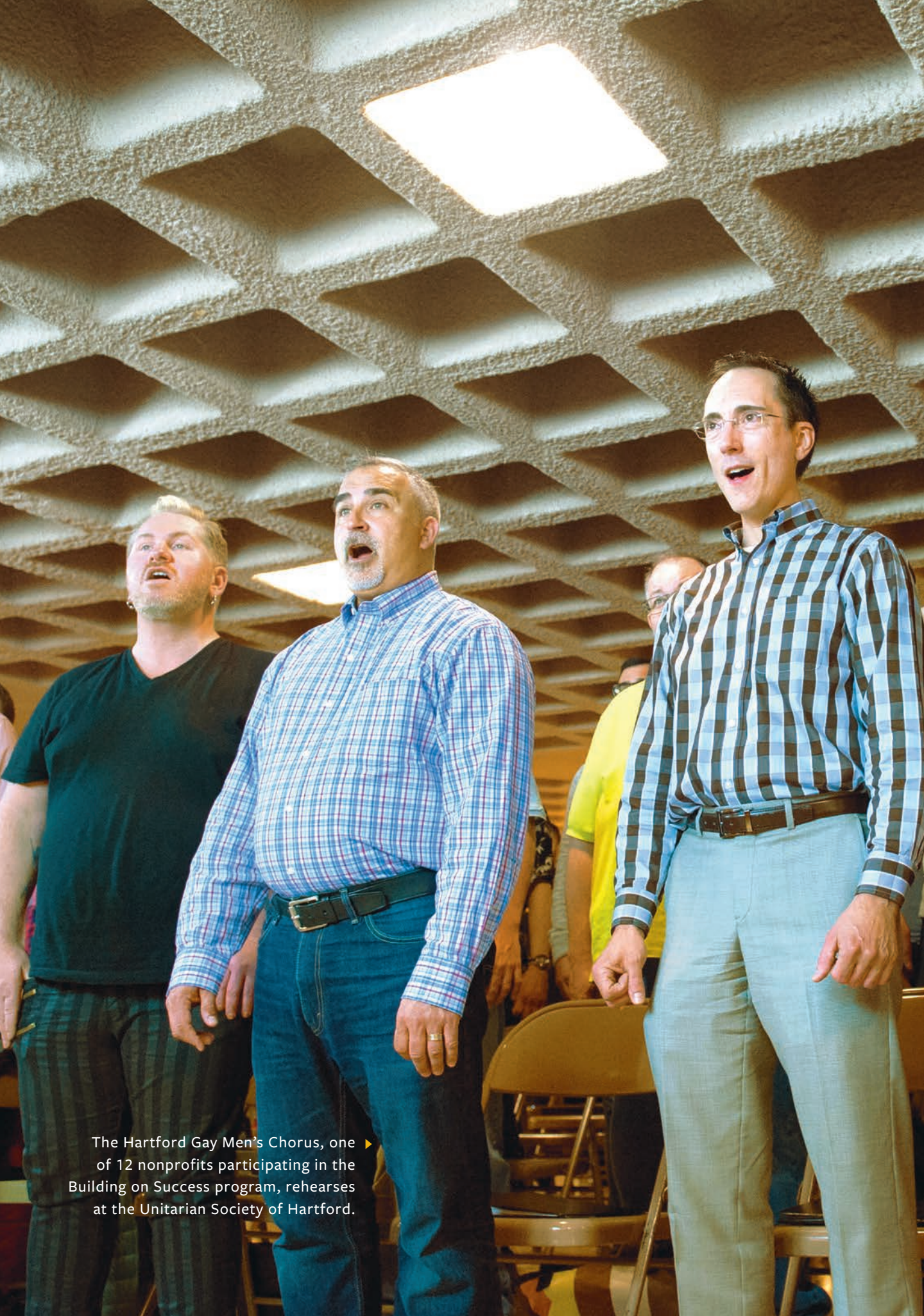
The Hartford Gay Men's Chorus, one of 12 nonprofits participating in the Building on Success program, rehearses at the Unitarian Society of Hartford.