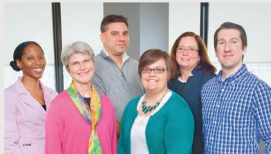
COMMUNICATIONS AND MARKETING ▶