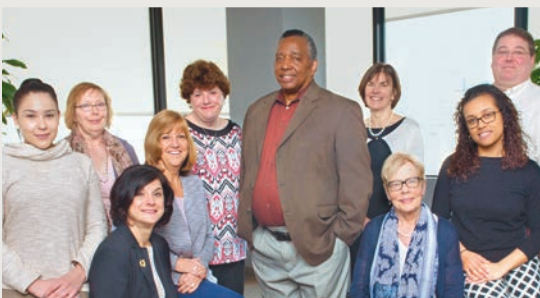
FINANCE AND ADMINISTRATION ▶