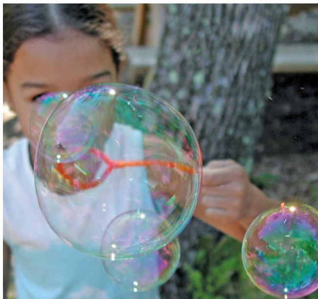
TALCOTT MOUNTAIN SCIENCE CENTER