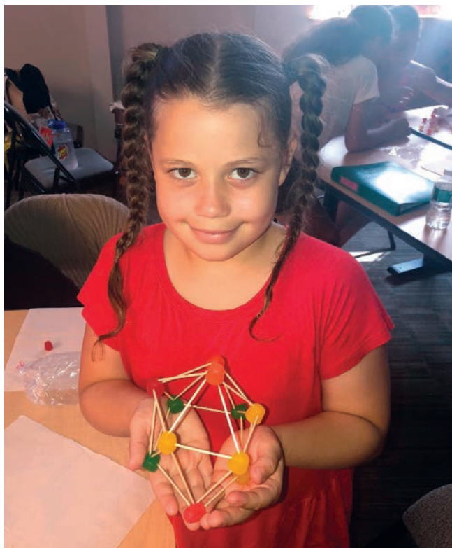
GIRL SCOUTS OF CONNECTICUT

Programs/Activities: Boating, Cooking, Crafts, Educational Activities, Games, Girls Only Activities, Horseback Riding, Nature or Environmental Learning, Recreational Swimming, Science Activities, Social Recreational Programming, Swim Lessons, Wilderness Activities Ages Served: 5–17 Areas Served: East Hartford, Hartford Start Date (first session): 06/24/19 End Date (last session): 08/10/19 Hours of Operation: Residential and Day camp Program Length: 6 weeks (1 to 6-week sessions) Fee: $235/week day camp; $480+/week resident camp, depending on program $ Transportation Available: No To Register: Customer Care Department Girl Scouts of Connecticut 20 Washington Avenue North Haven, CT 06473 1-800-922-2770 camp@gsofct.org Website: www.gsofct.org/en/camp/summer-camps.html Registration Deadline: Two weeks prior to start of camp session or until filled