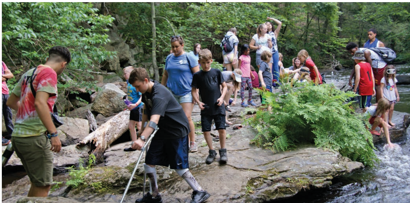
CHANNEL 3 KIDS CAMP