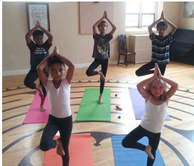
SPECTRUM IN MOTION