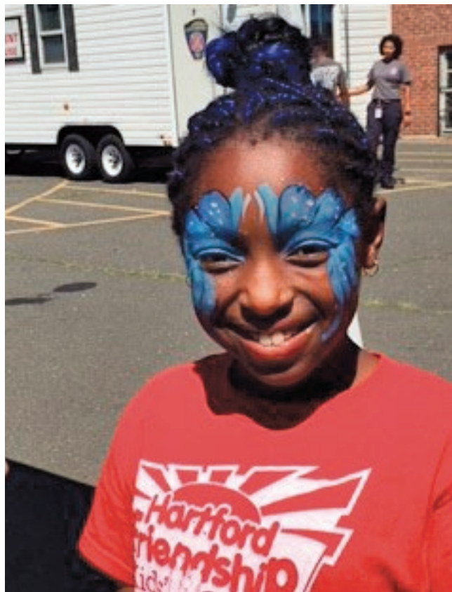
HARTFORD FRIENDSHIP KIDS' CAMP