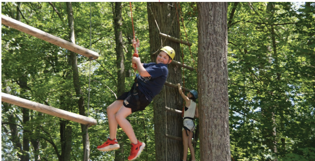
CHANNEL 3 KIDS CAMP

↑ Program operates at a school-based site. Please call for the most up-to-date information on program dates, times, lengths and location as these are subject to change.