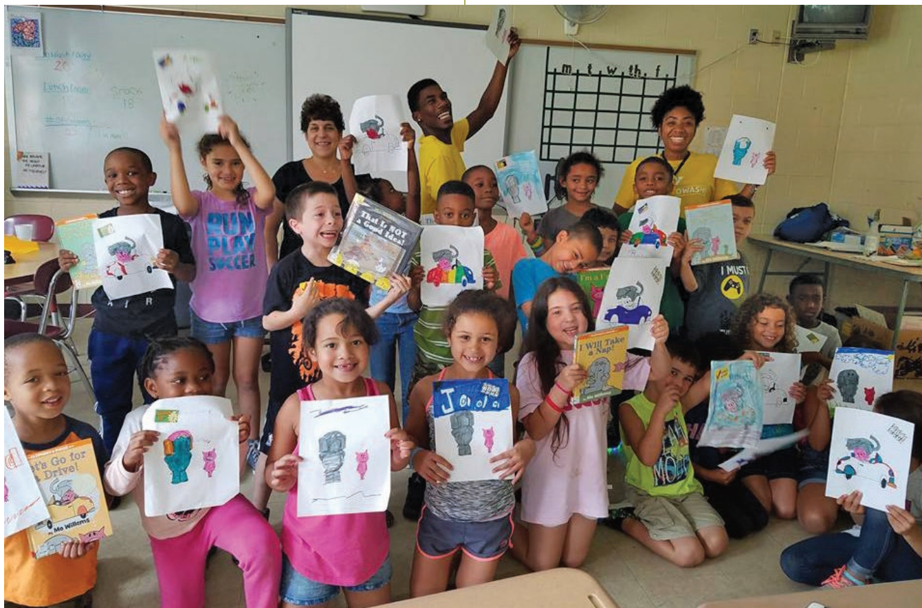
EAST HARTFORD YMCA