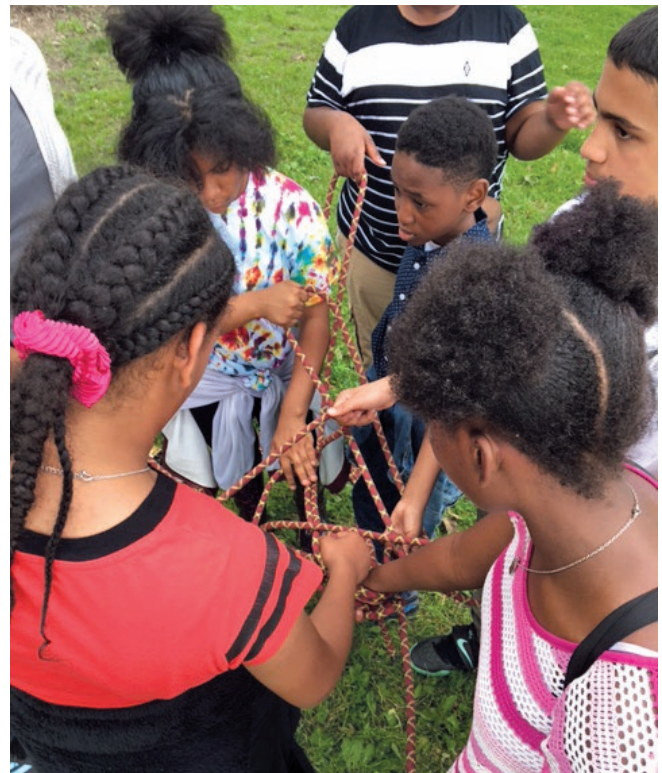
HARTFORD YOUTH SCHOLARS