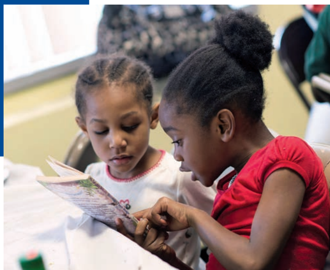
ASYLUM HILL FAMILY CENTER

Parents, caregivers and young children can engage in a variety of enjoyable educational activities at any one of Hartford's six Brighter Futures Family Centers.