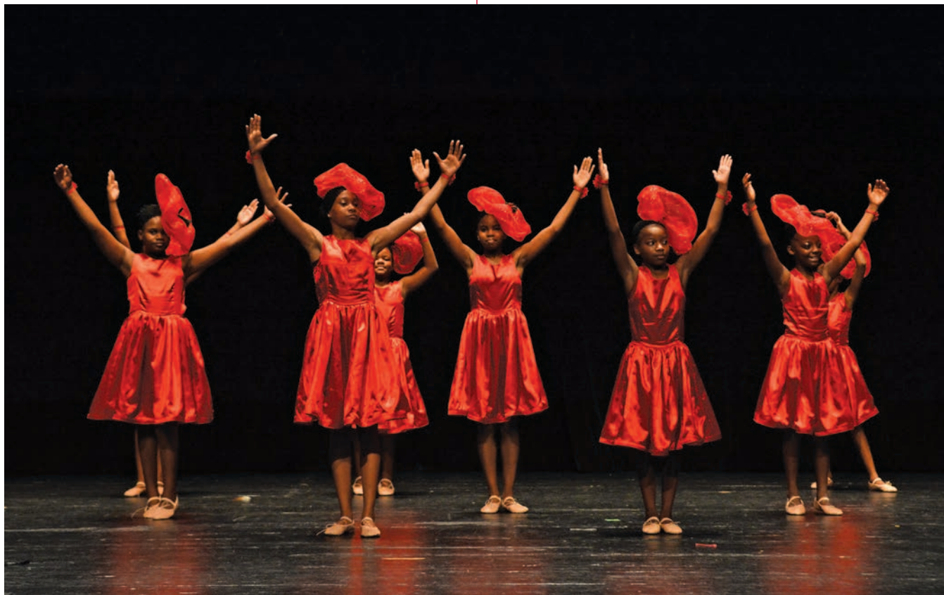
CULTURAL DANCE TROUPE